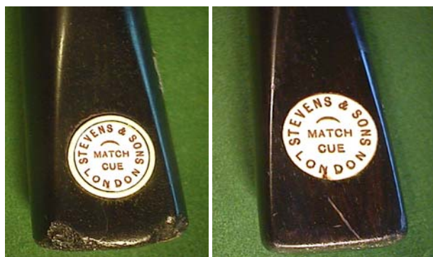
Examples of the Stevens Match Cue with the earlier version on the left